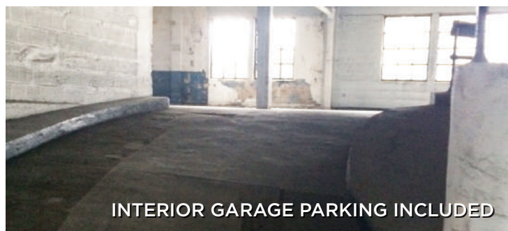
INTERIOR GARAGE PARKING INCLUDED