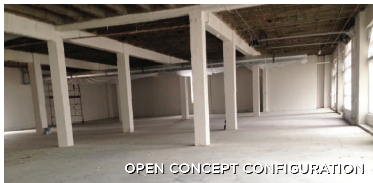
OPEN CONCEPT CONFIGURATION