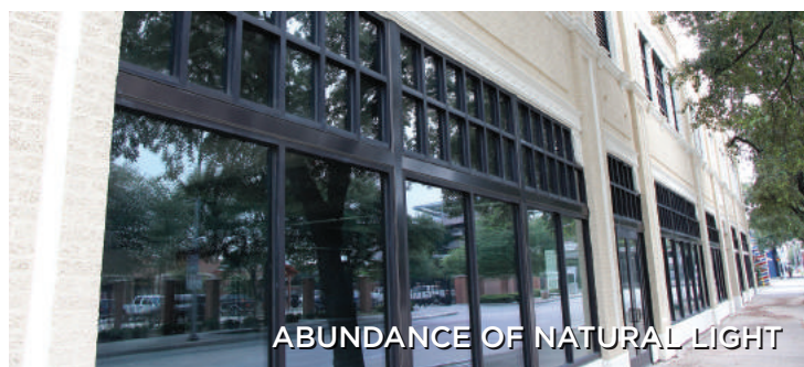
ABUNDANCE OF NATURAL LIGHT